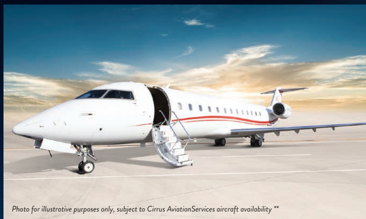
Photo for illustrative purposes only, subject to Cirrus Aviation Services aircraft availability **